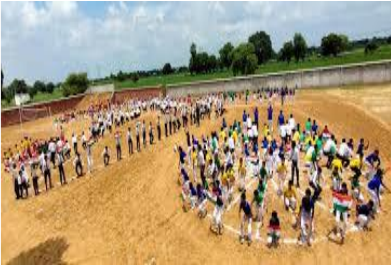
Dance Activities on Festivals