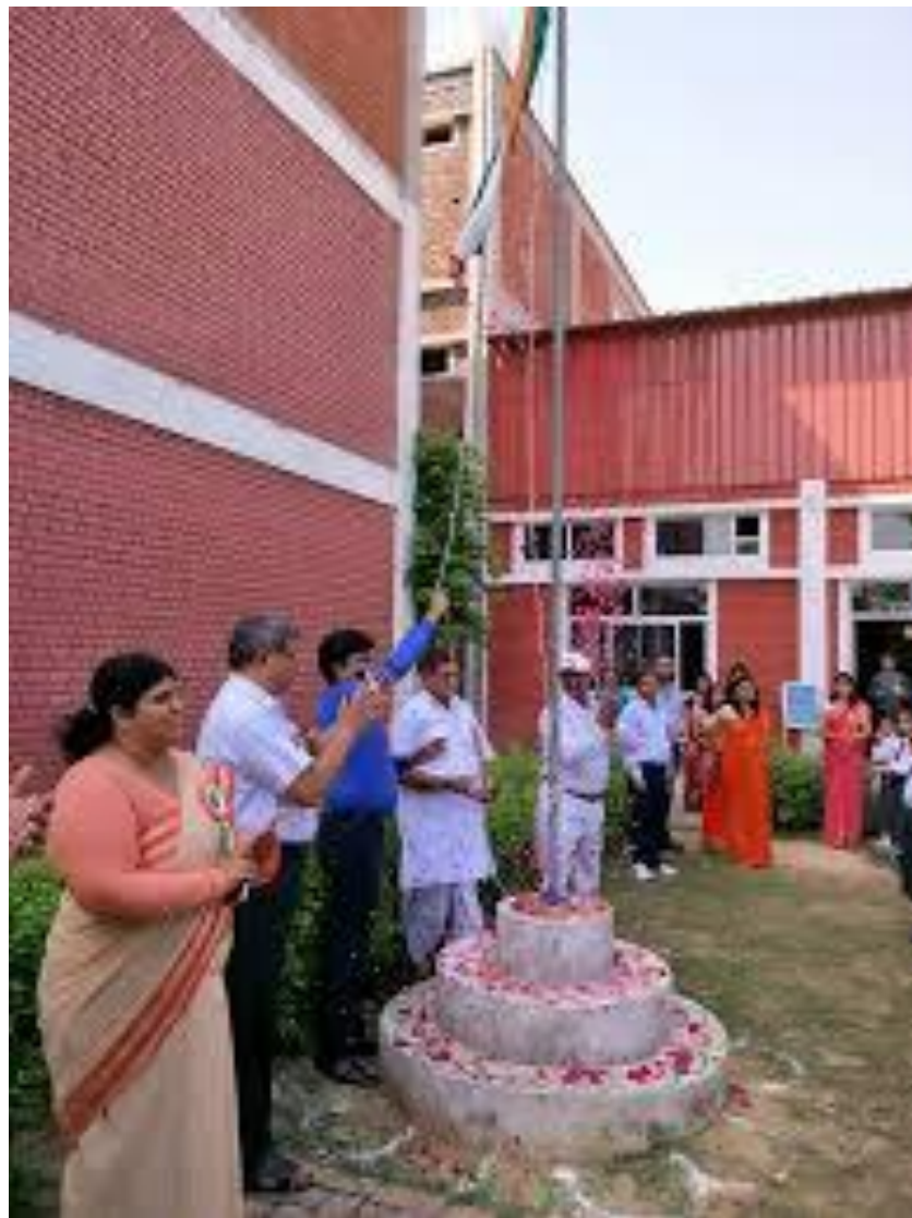
Independence Day Program Tiranga Rally